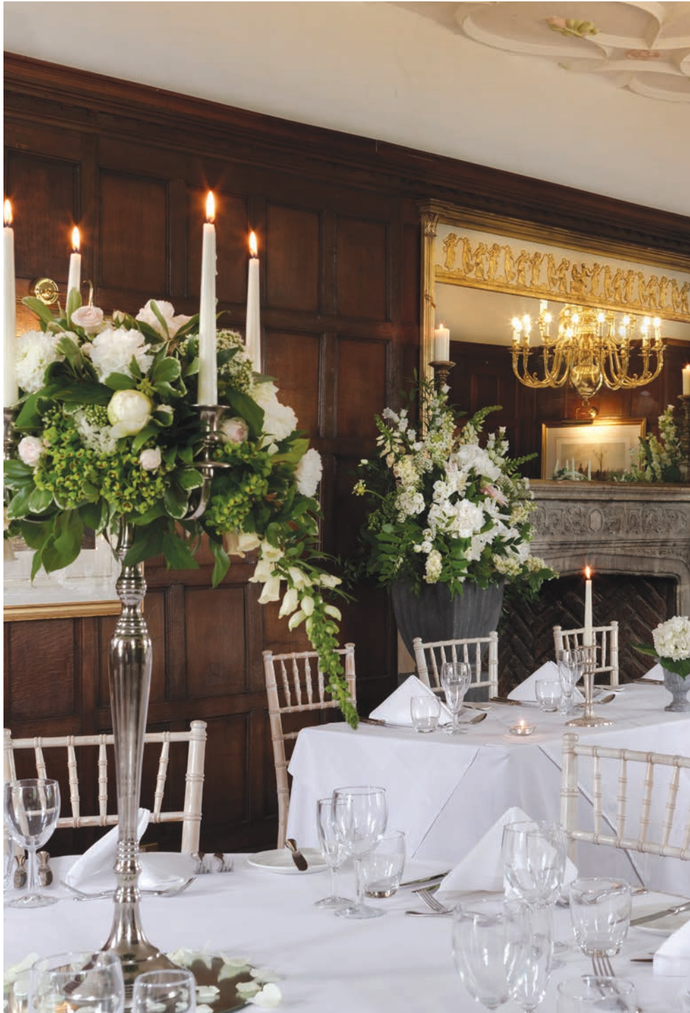
Flowers by Emily&amp;Me